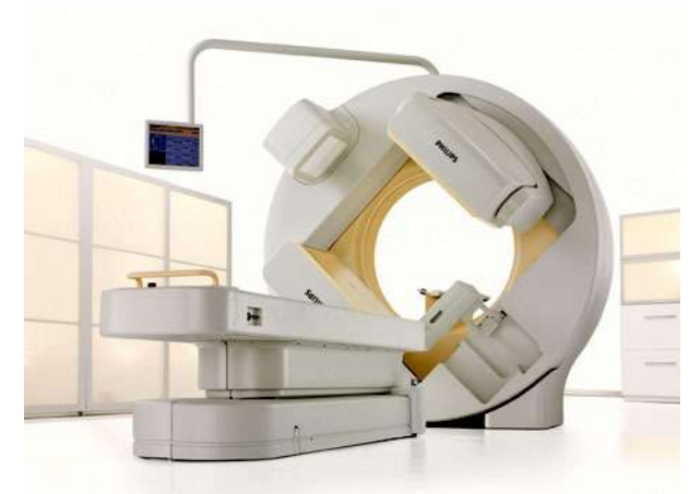
This is one of the Cameras used for the scan.